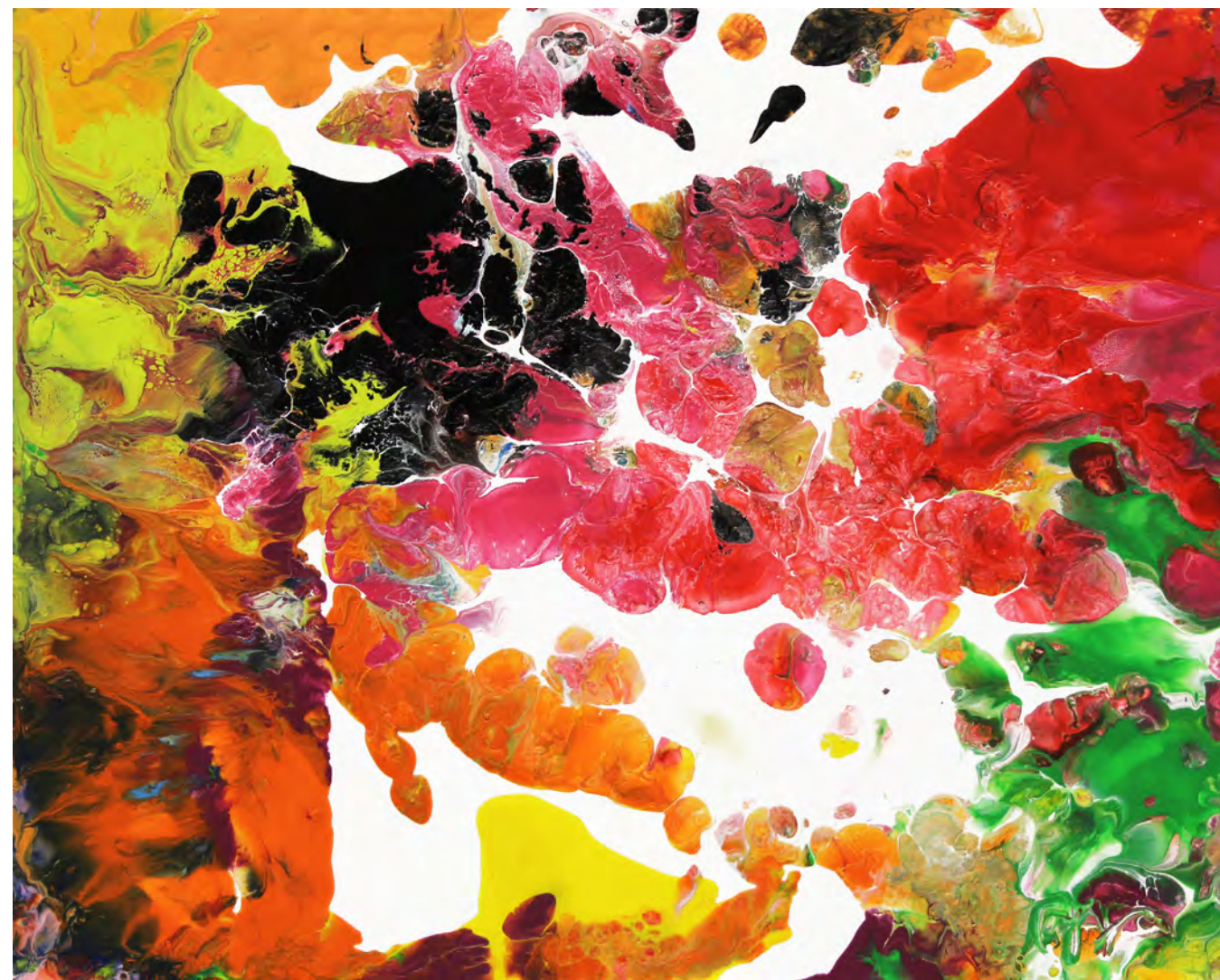
Cluffalo 163 , 2017, latex on expanded pvc, 8 x 10 inches