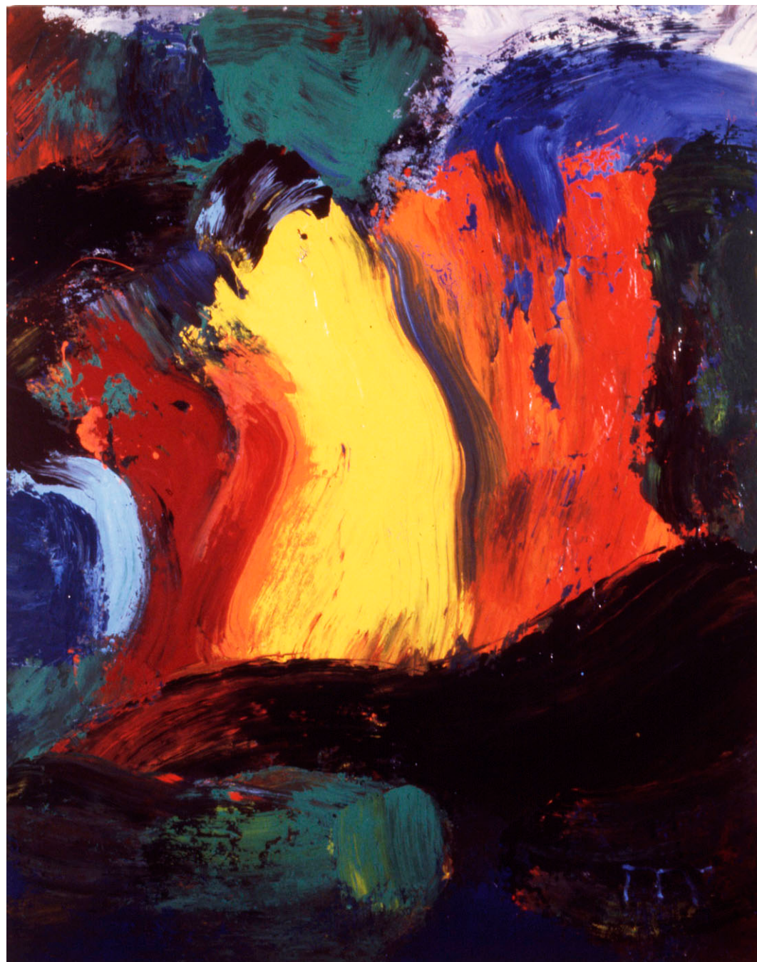
Castalia , 1994 enamel on canvas, 84 x 67 inches.