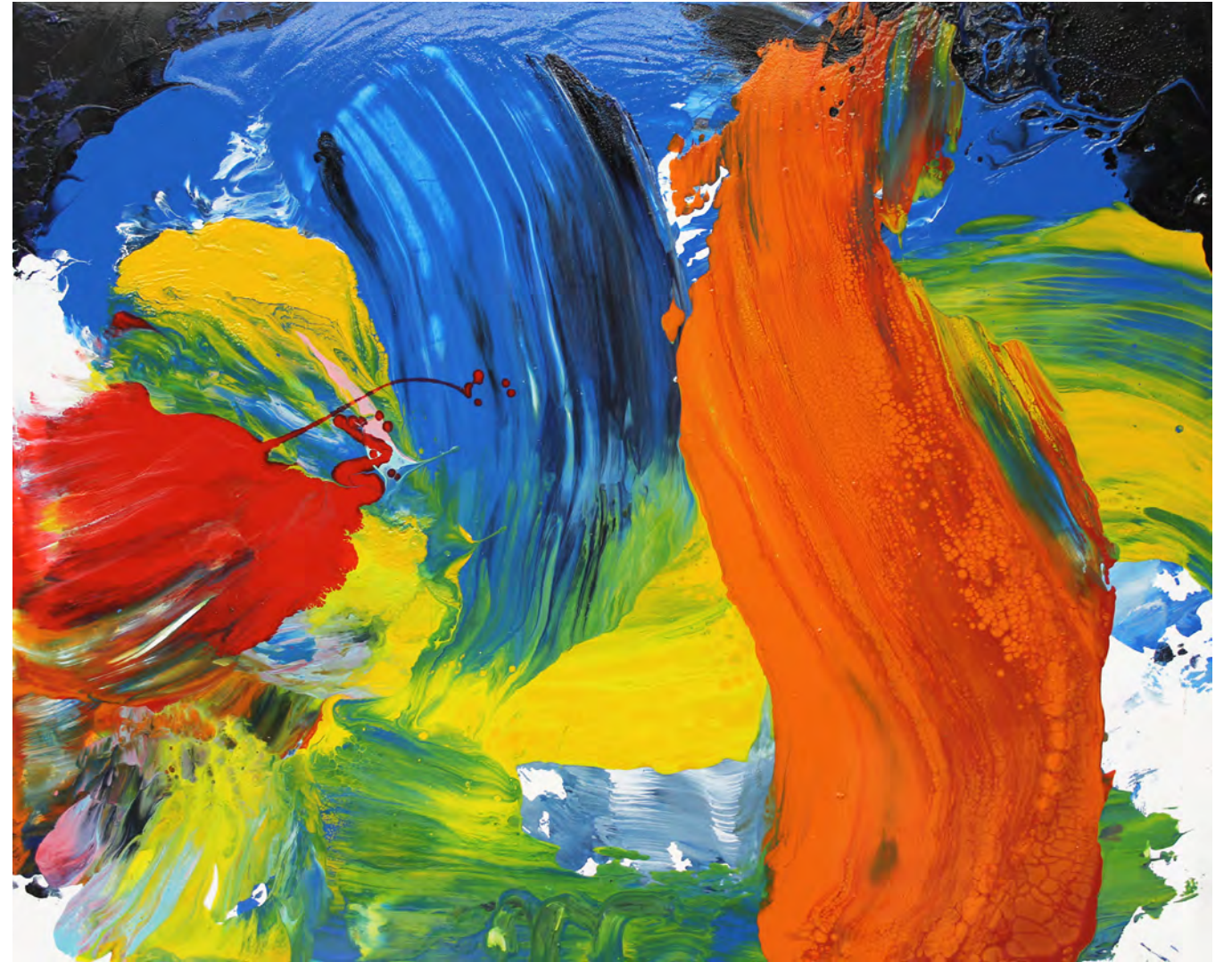
Cluffalo 131 , 2017, acrylic on board, 16 x 20 inches