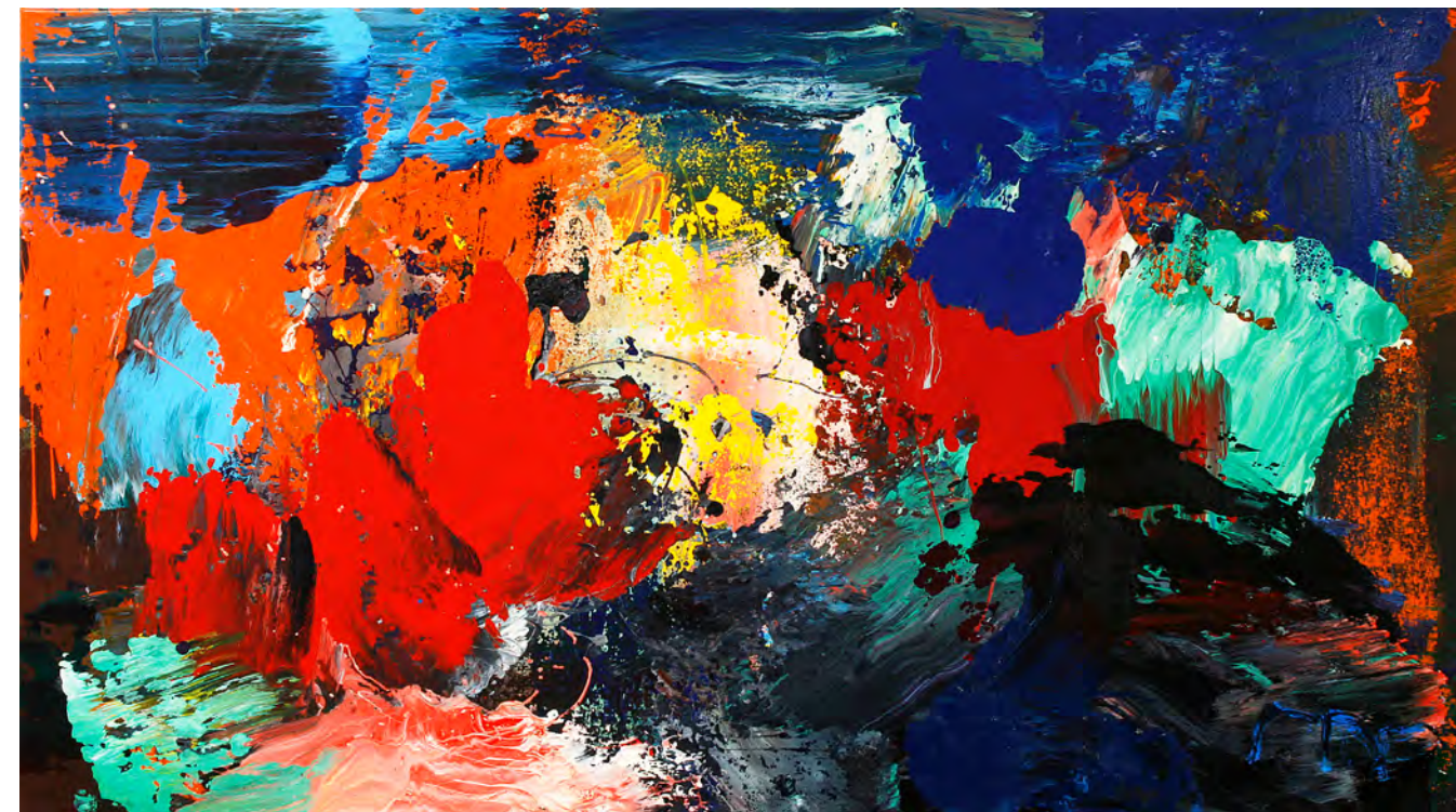
Tuvalu , 1994, enamel on canvas, 38 x 68 inches.