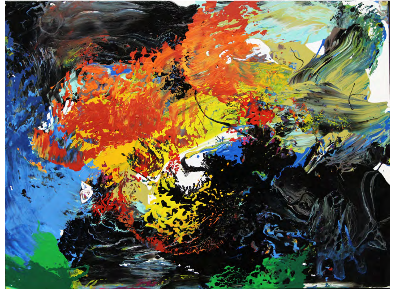
Cluffalo 170, 2018, latex on expanded pvc, 24 x 32 inches