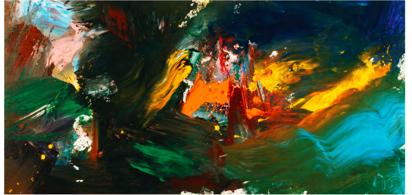
The Way to Cluffalo , 2011, acrylic on canvas, 39 x 80 inches