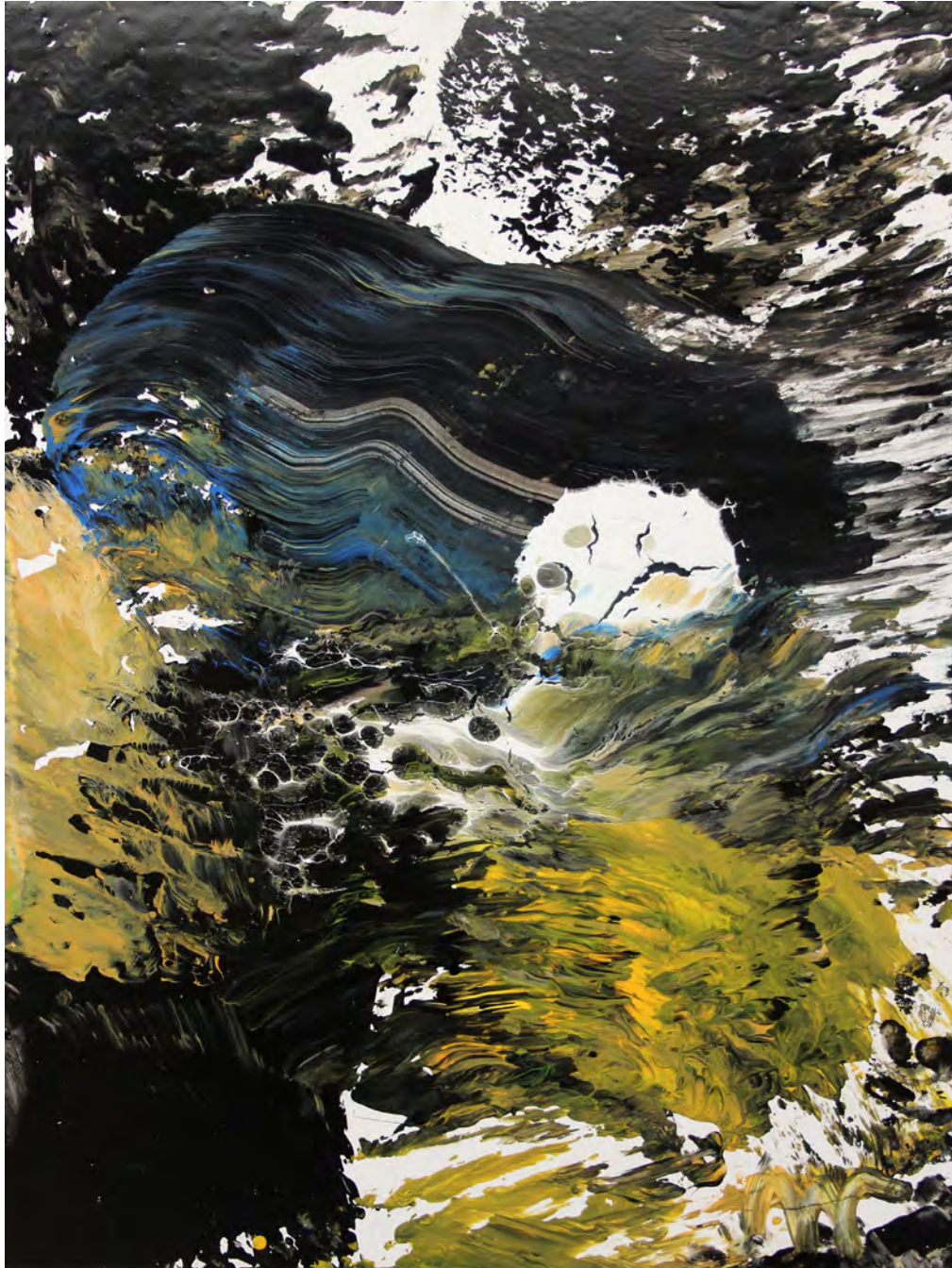
Cluffalo 137, 2017, latex on expanded pvc, 32 x 24 inches.