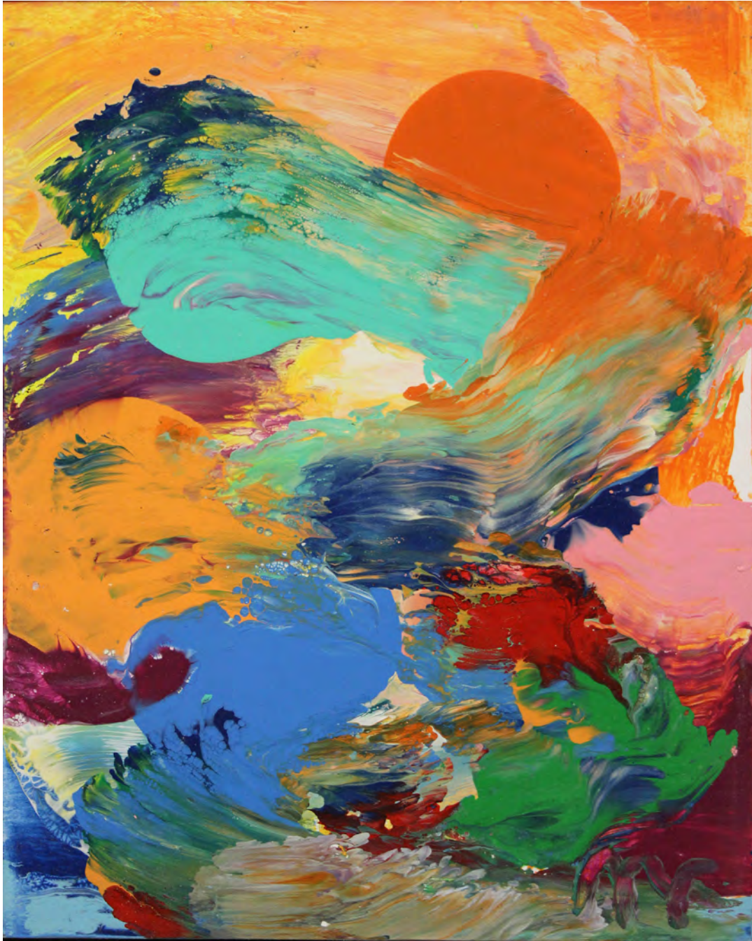
Cluffalo 091 , 2016, latex on expanded pvc, 20 x 16 inches.