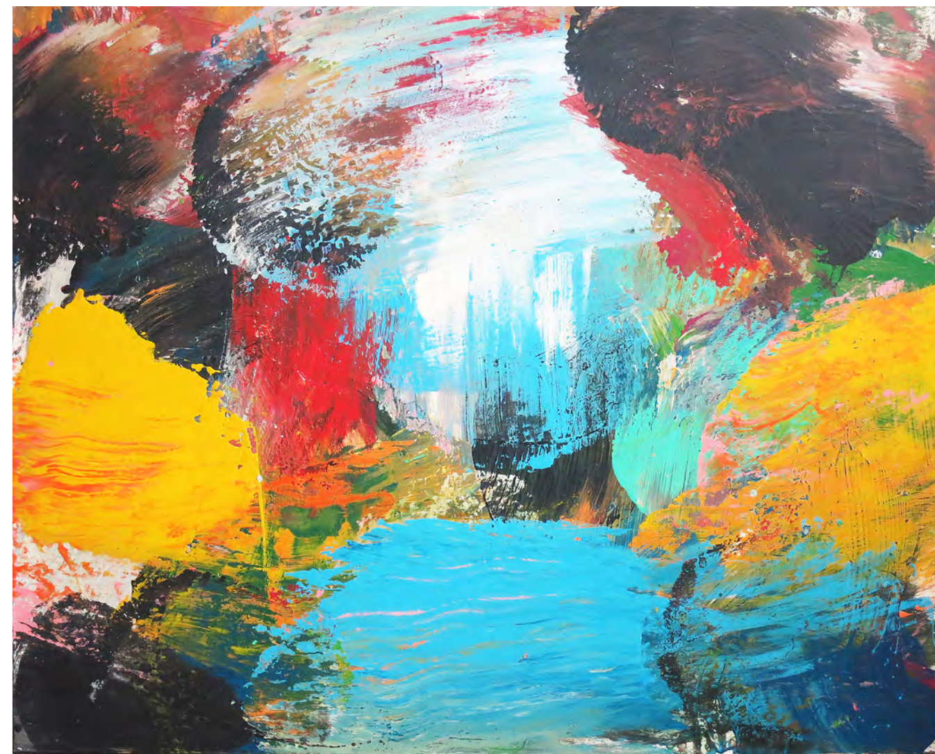
Cluffalo 004 , 2014, acrylic on board, 48 x 60 inches