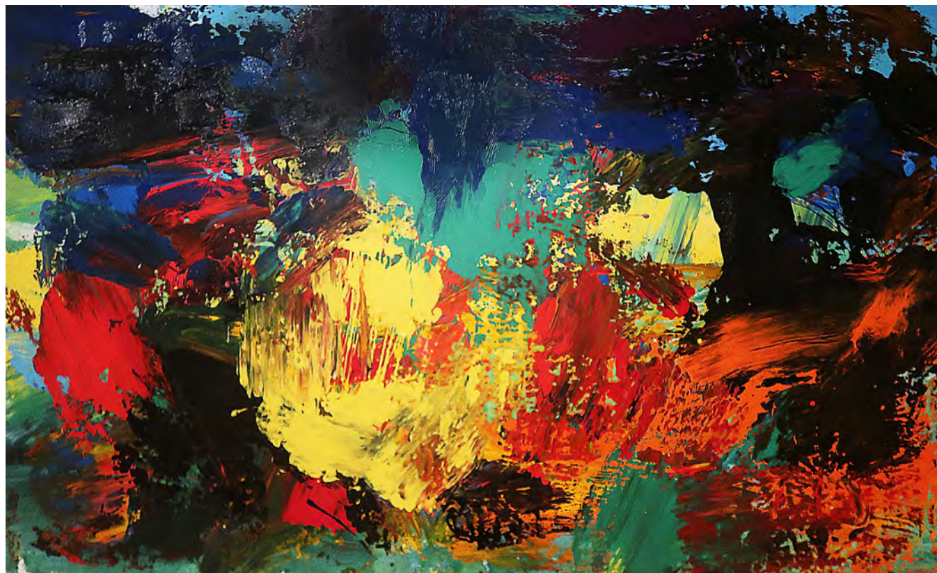
Kitron , 1994, enamel on canvas, 50 x 82 inches.