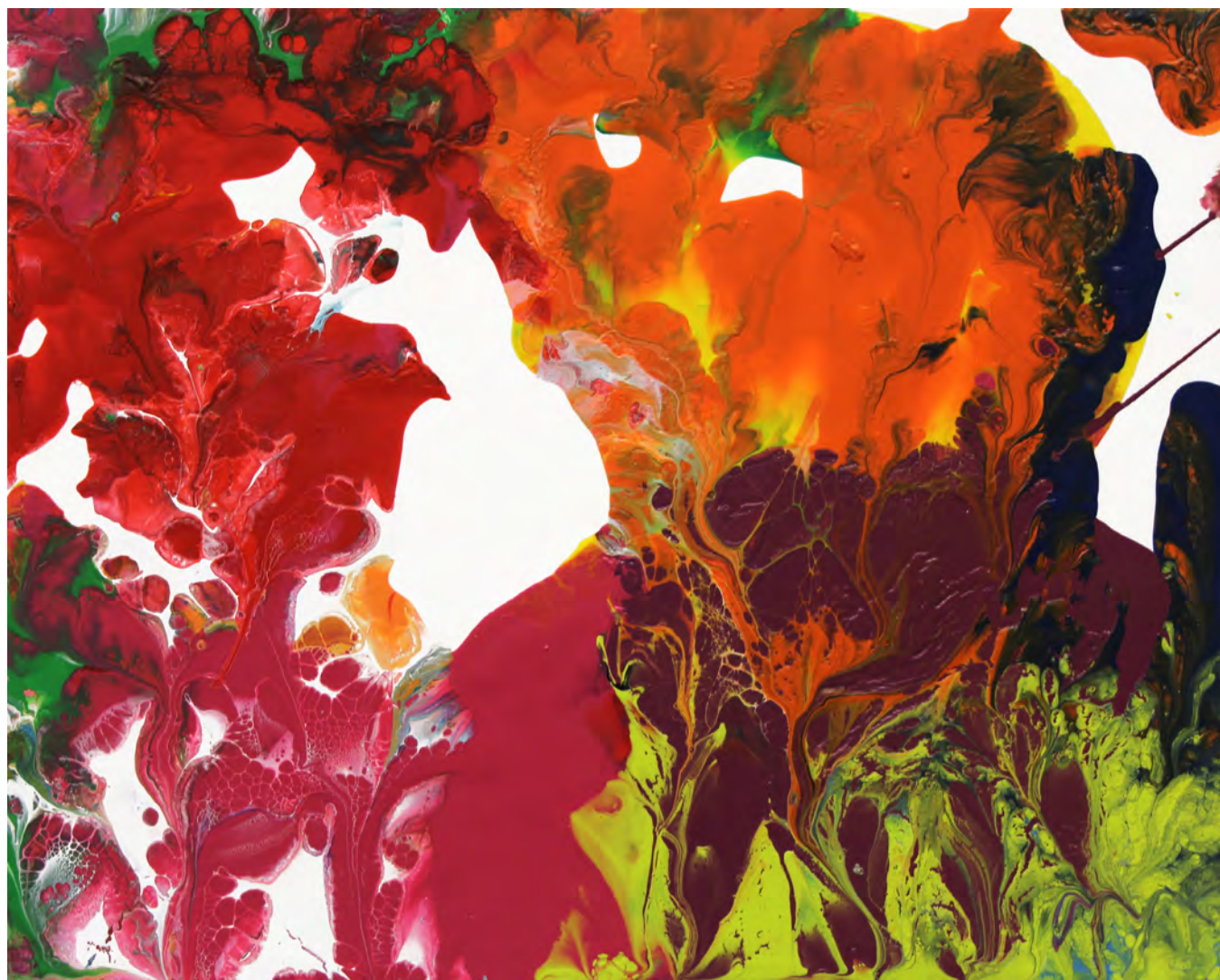
Cluffalo 160 , 2017, latex on expanded pvc, 8 x 10 inches