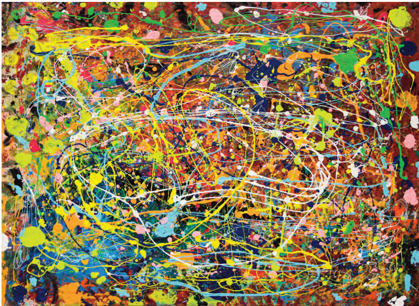
Cluffalo: Autumn 2015 Twenty-first State, 2015, latex on expanded pvc, 32 x 44 inches