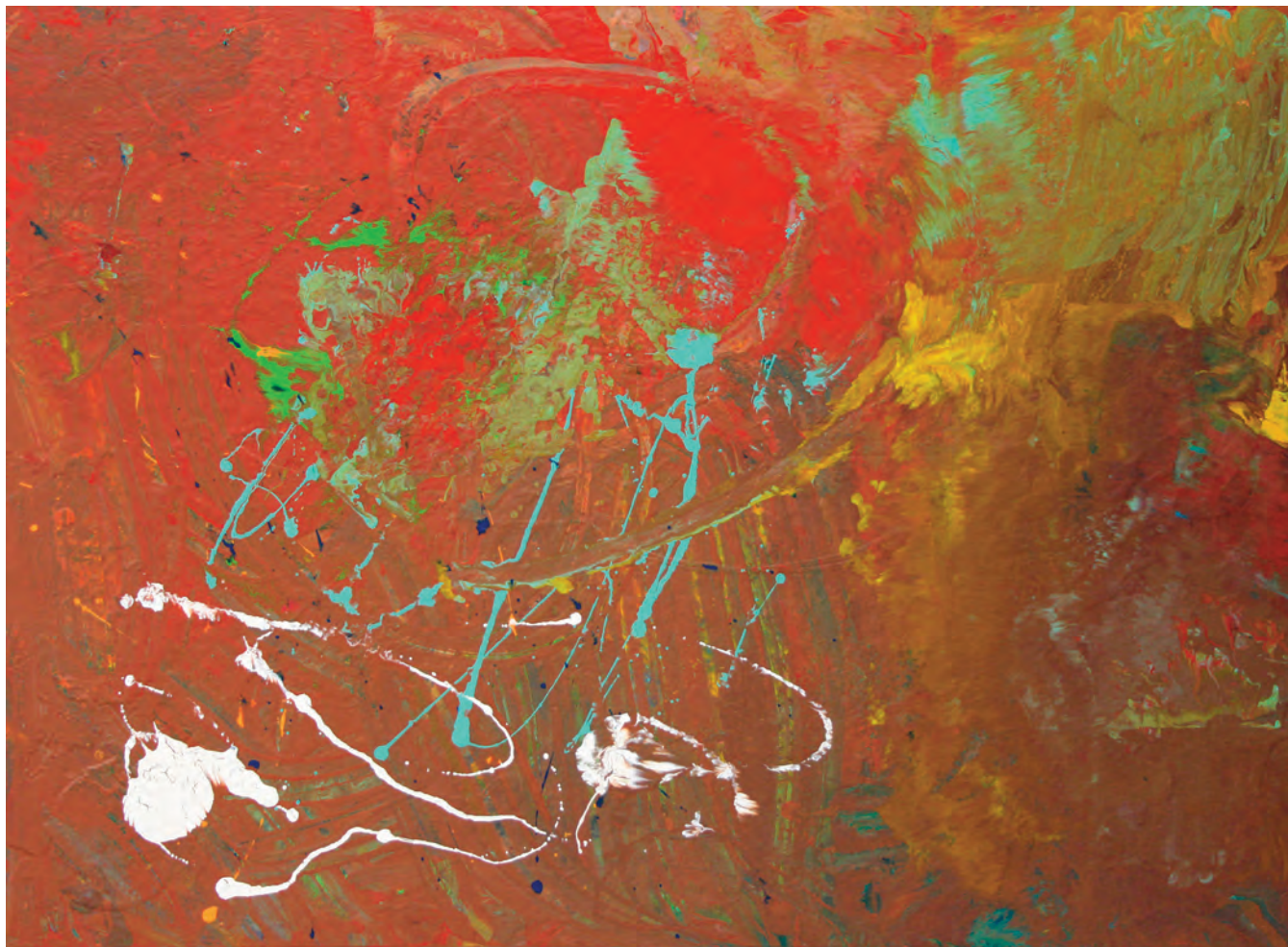
Cluffalo: Autumn 2015 Eighth State , 2015, latex on expanded pvc, 32 x 44 inches