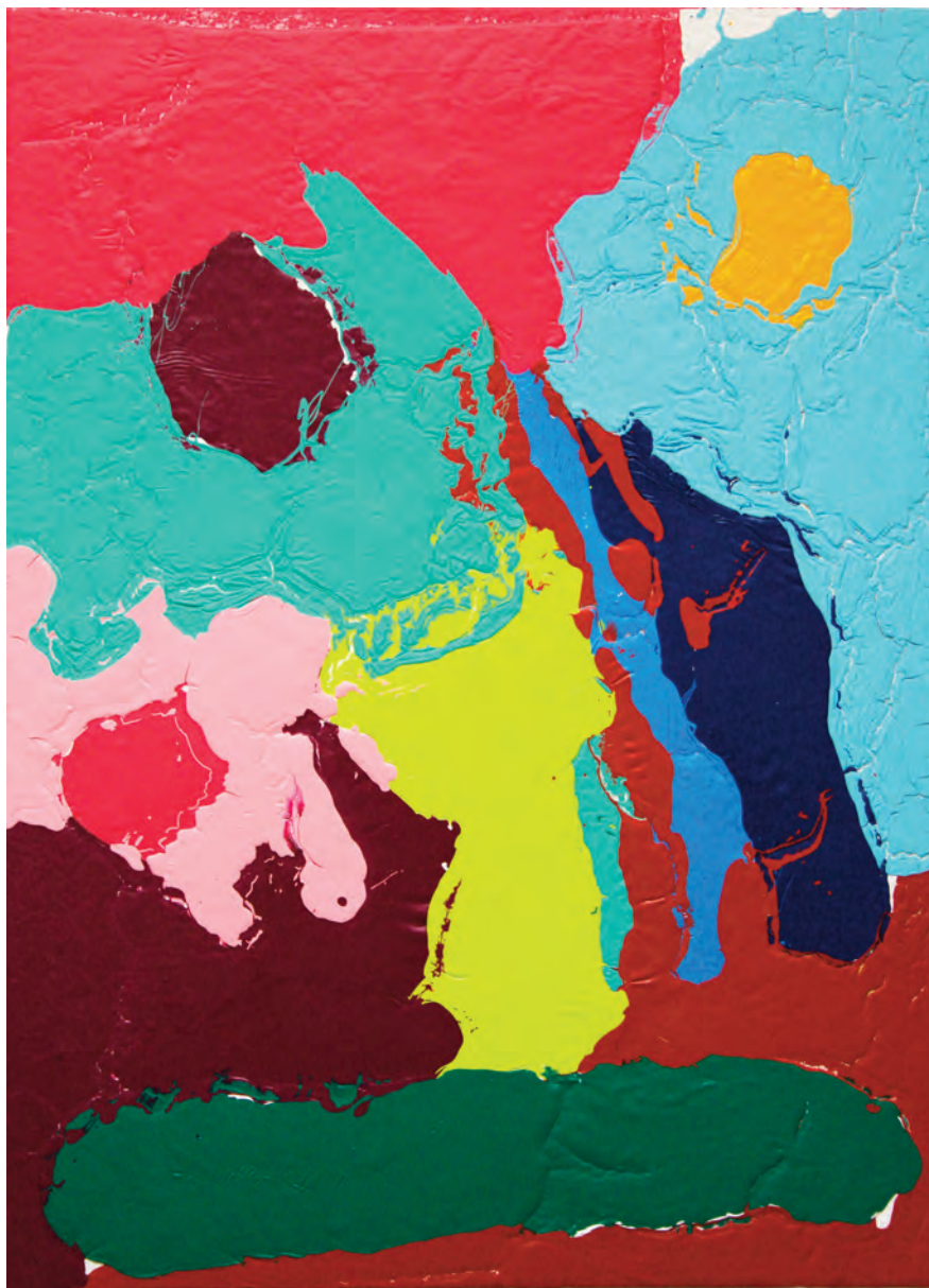
Cluffalo: Autumn 2015 Twenty-sixth State, 2015, latex on expanded pvc, 32 x 44 inches