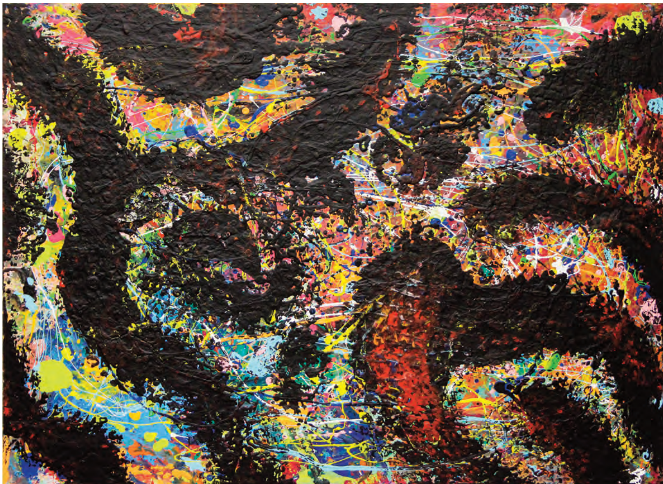
Cluffalo: Autumn 2015 Twenty-second State, 2015, latex on expanded pvc, 32 x 44 inches