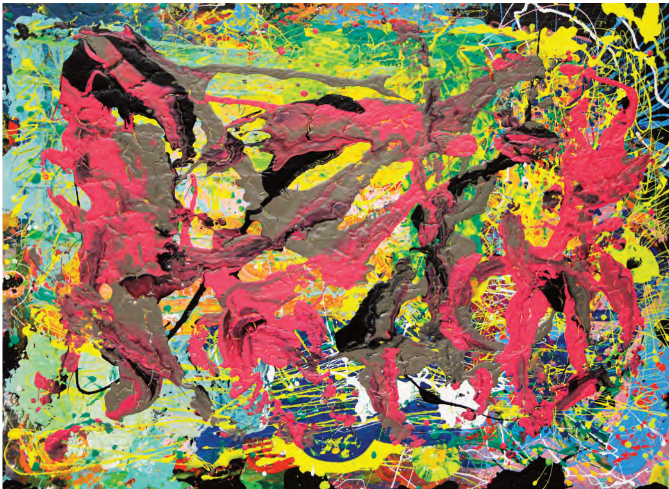
Cluffalo: Autumn 2015 Seventeenth State , 2015, latex on expanded pvc, 32 x 44 inches