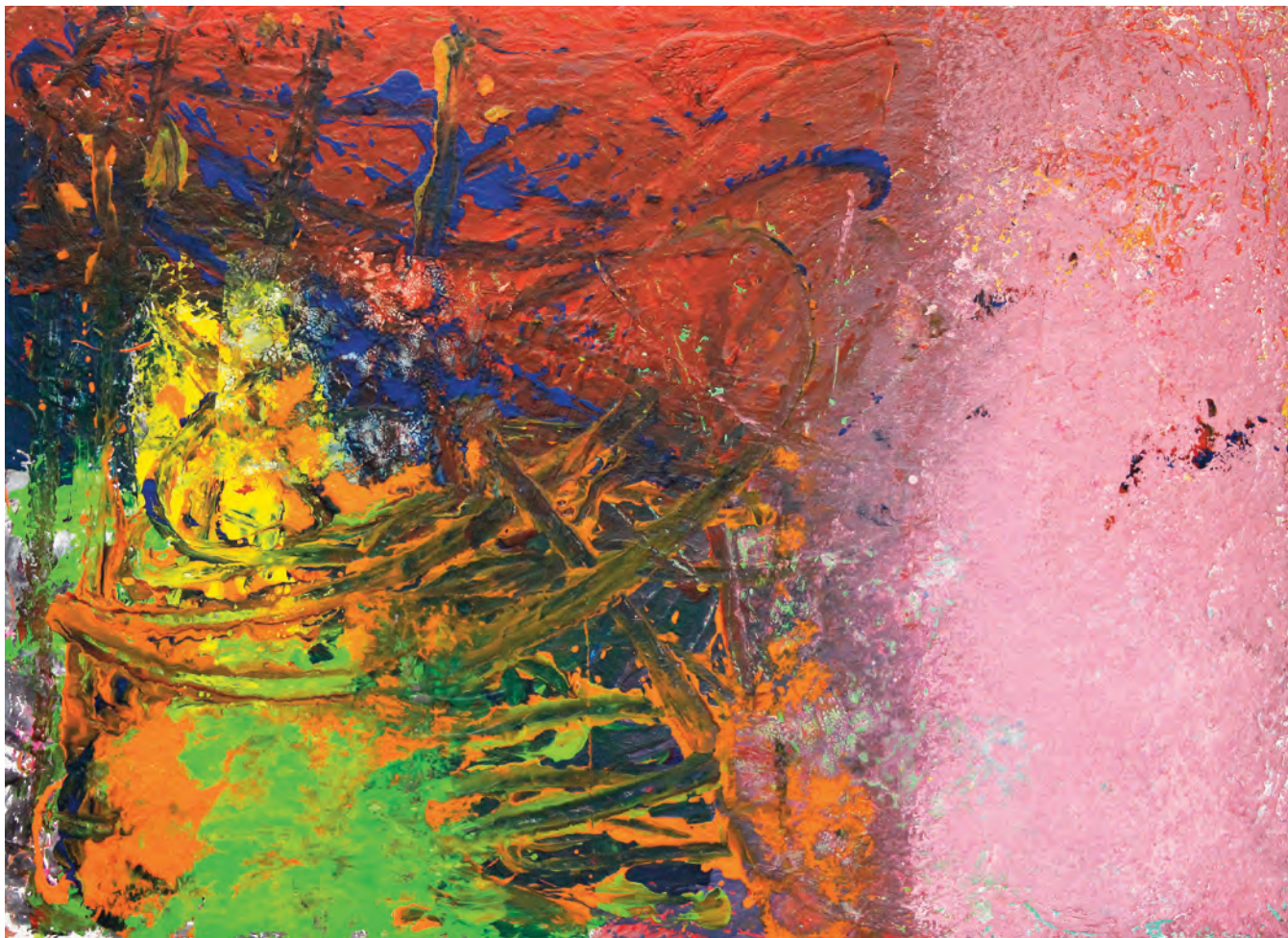
Cluffalo: Autumn 2015 Eleventh State, 2015, latex on expanded pvc, 32 x 44 inches