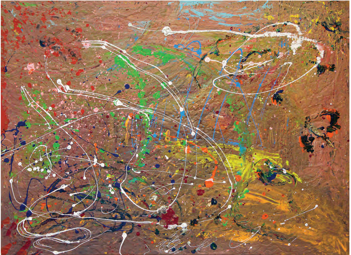
Cluffalo: Autumn 2015 Eighteenth State, 2015, latex on expanded pvc, 32 x 44 inches