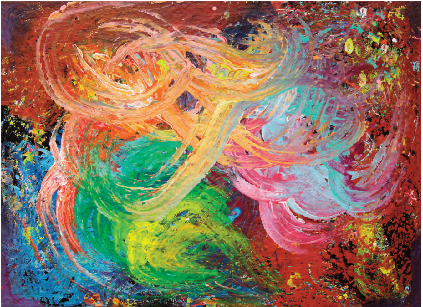
Cluffalo: Autumn 2015 Twenty-fourth State, 2015, latex on expanded pvc, 32 x 44 inches