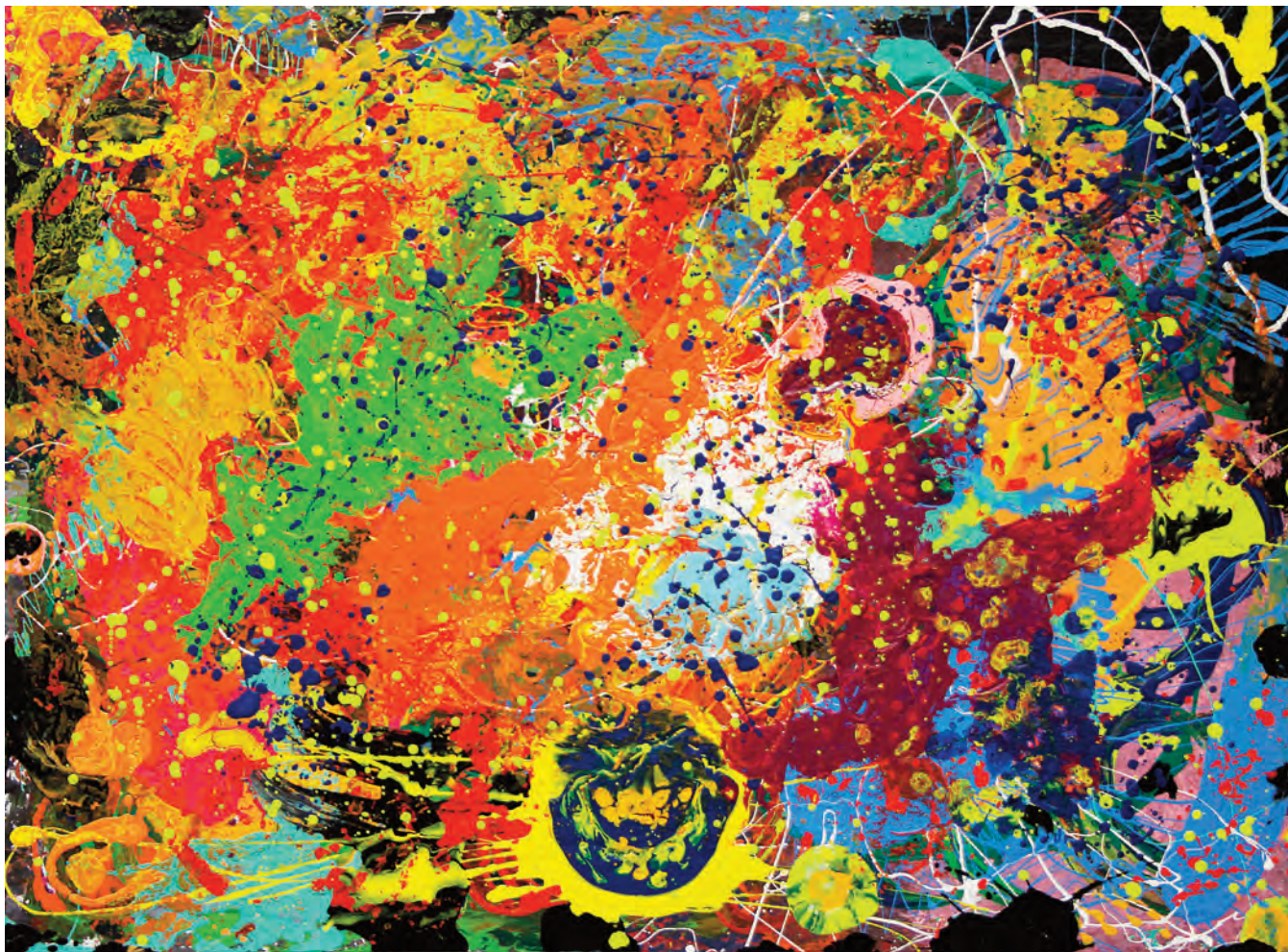
Cluffalo: Autumn 2015 Fifteenth State, 2015, latex on expanded pvc, 32 x 44 inches