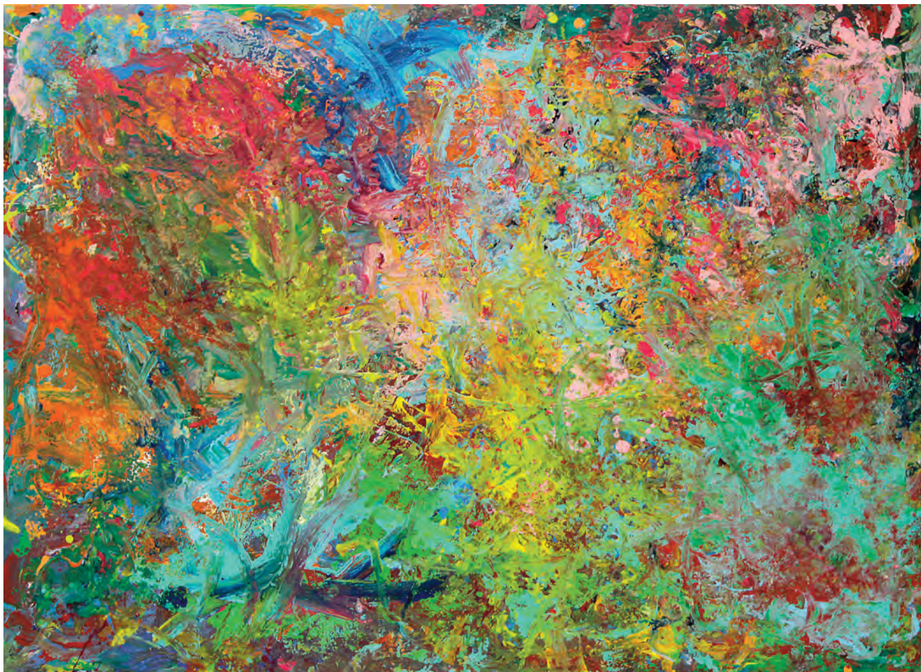
Cluffalo: Autumn 2015 Seventh State, 2015, latex on expanded pvc, 32 x 44 inches