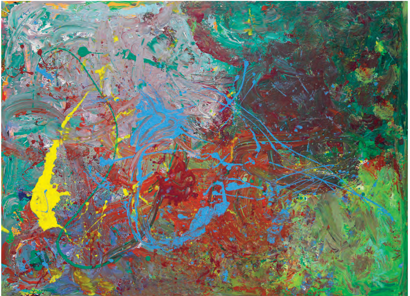
Cluffalo: Autumn 2015 Fifth State, 2015, latex on expanded pvc, 32 x 44 inches