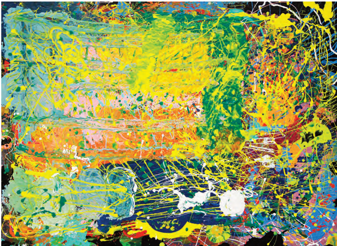
Cluffalo: Autumn 2015 Sixteenth State, 2015, latex on expanded pvc, 32 x 44 inches