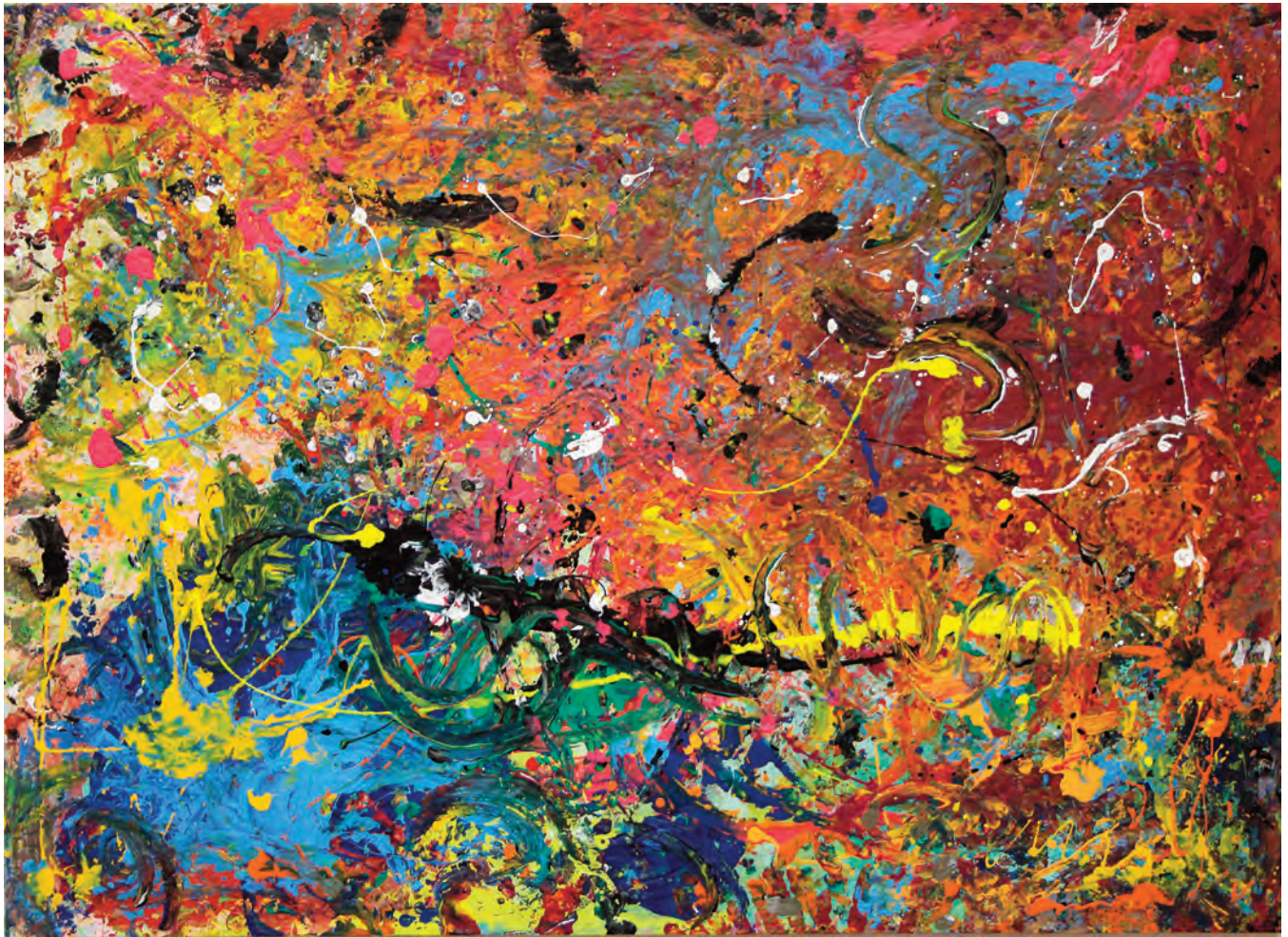
Cluffalo: Autumn 2015 Twentieth State, 2015, latex on expanded pvc, 32 x 44 inches