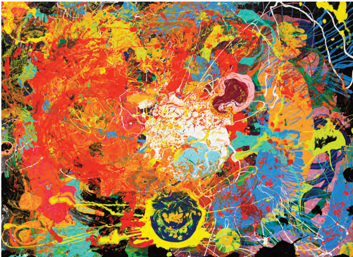
Cluffalo: Autumn 2015 Fourteenth State, 2015, latex on expanded pvc, 32 x 44 inches