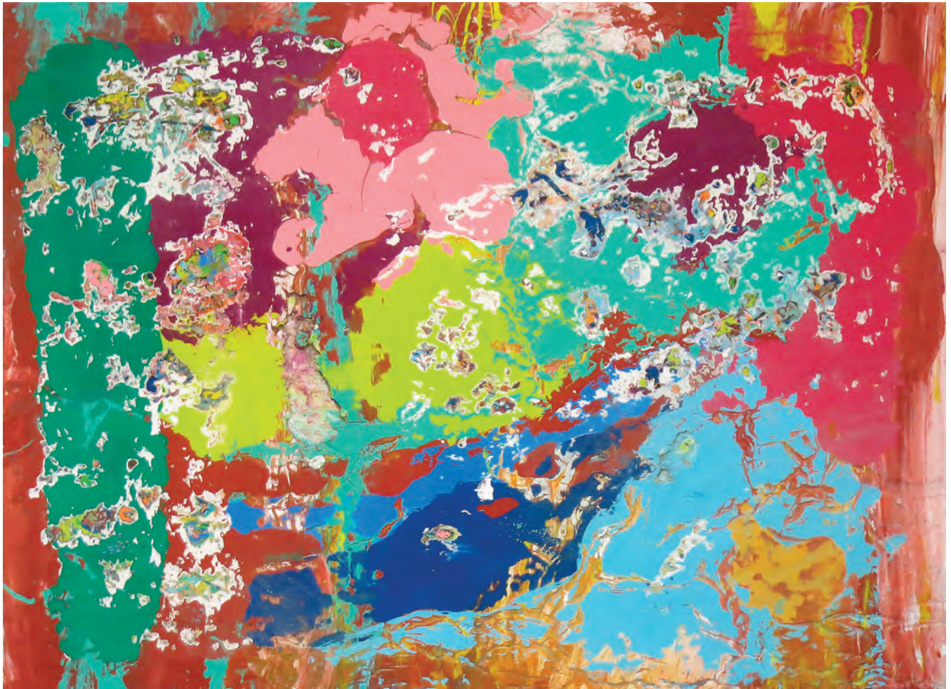
Cluffalo: Autumn 2015 Thirtieth State, 2015, latex on expanded pvc, 32 x 44 inches