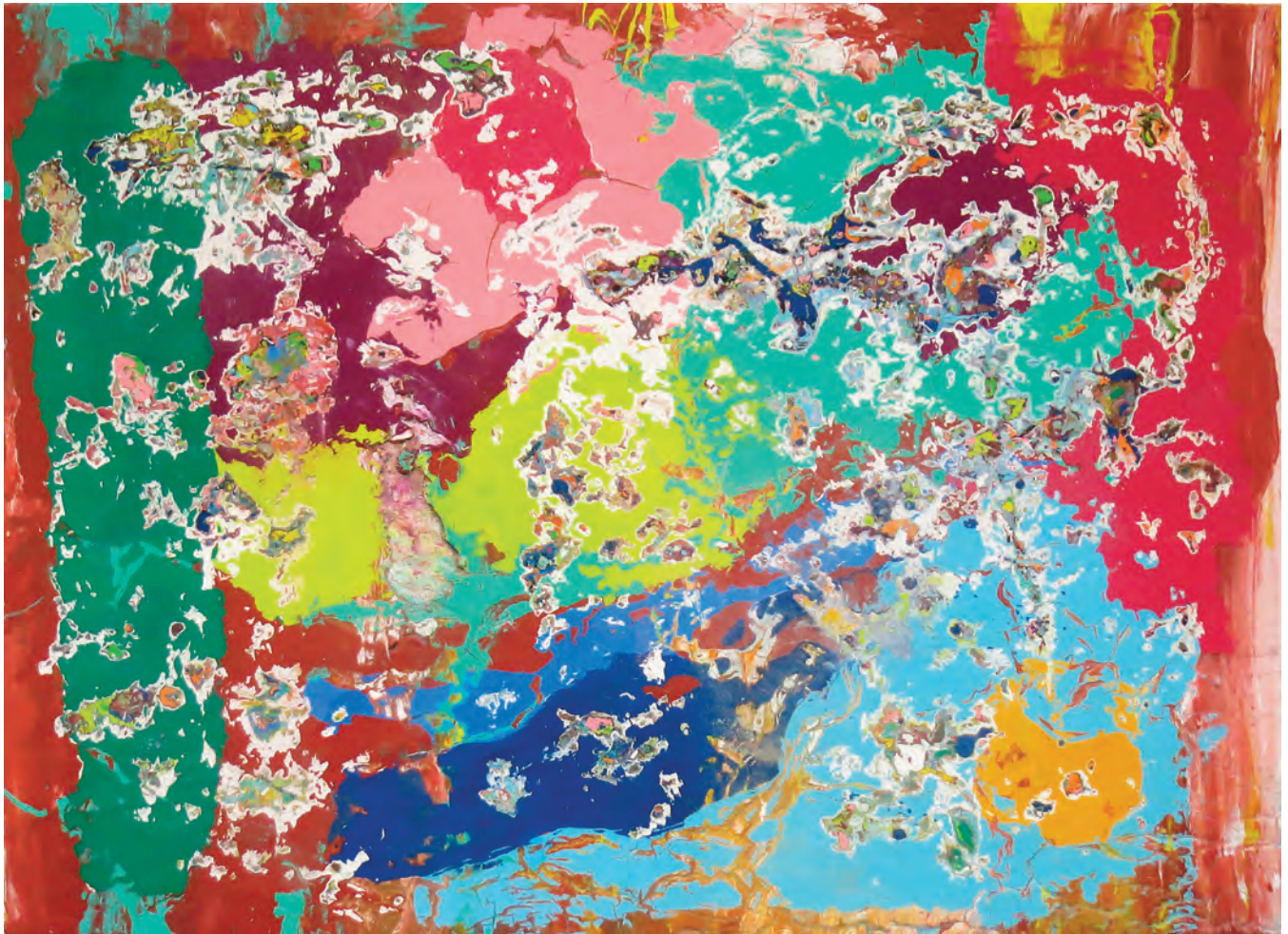
Cluffalo: Autumn 2015 Thirty-first State, 2015, latex on expanded pvc, 32 x 44 inches