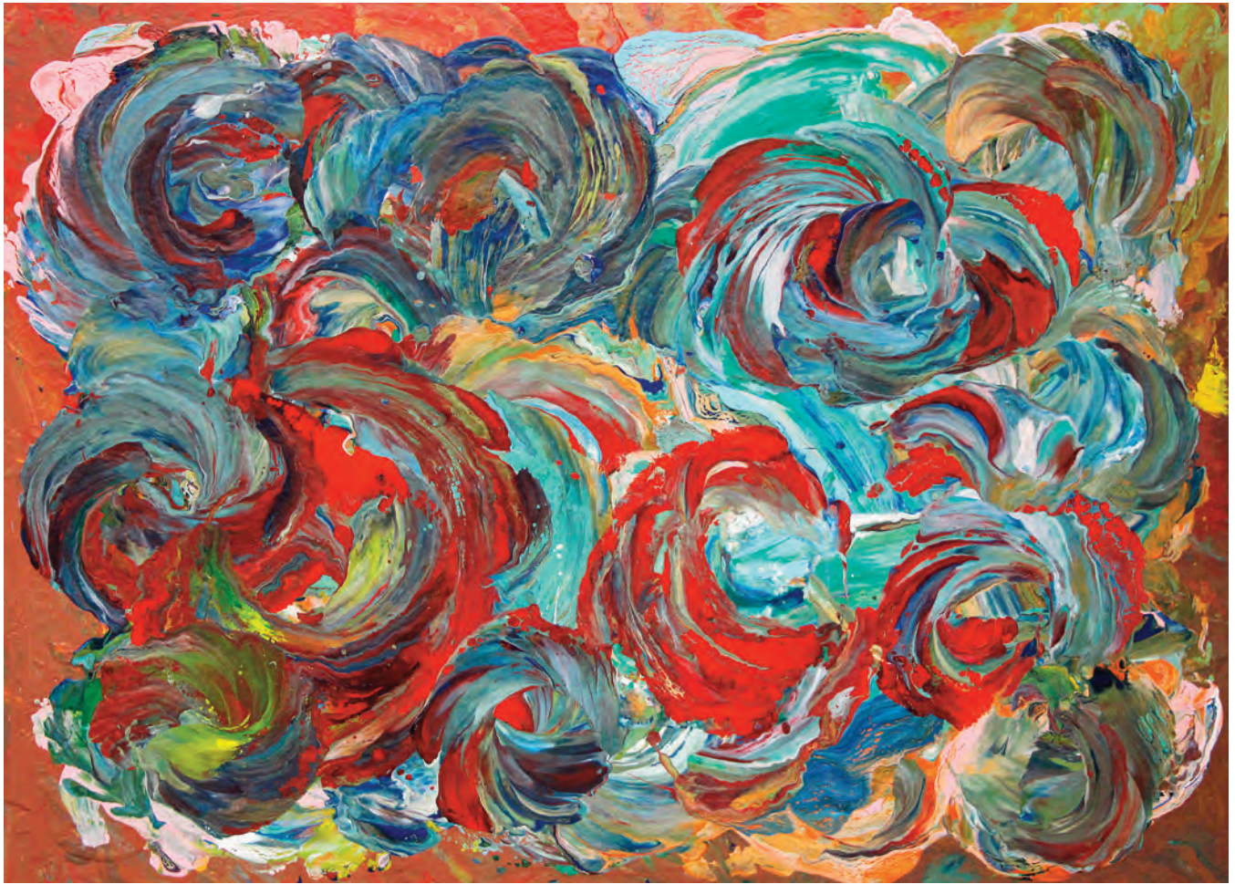
Cluffalo: Autumn 2015 Ninth State , 2015, latex on expanded pvc, 32 x 44 inches