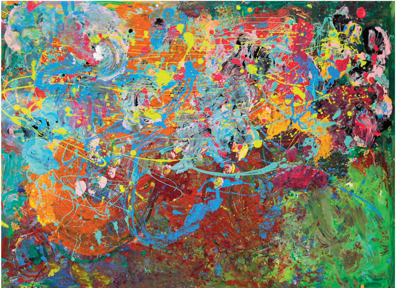
Cluffalo: Autumn 2015 Sixth State, 2015, latex on expanded pvc, 32 x 44 inches