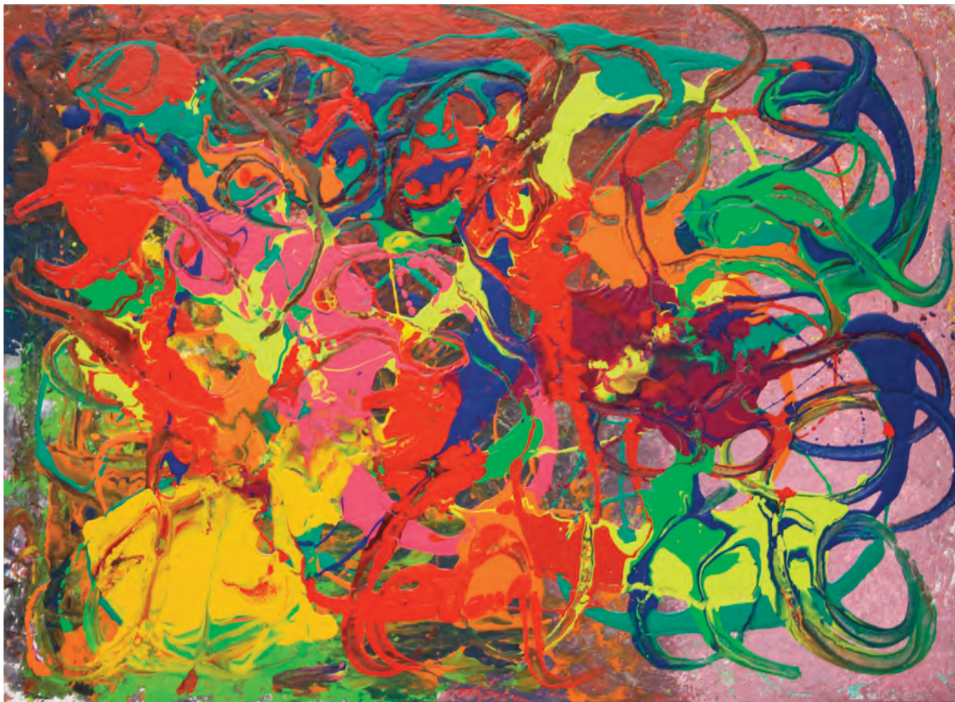
Cluffalo: Autumn 2015 Twelfth State , 2015, latex on expanded pvc, 32 x 44 inches