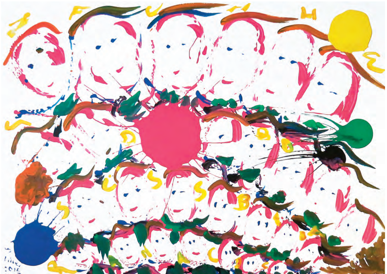
Cluffalo: Autumn 2015 First State, 2015, latex on expanded pvc, 32 x 44 inches