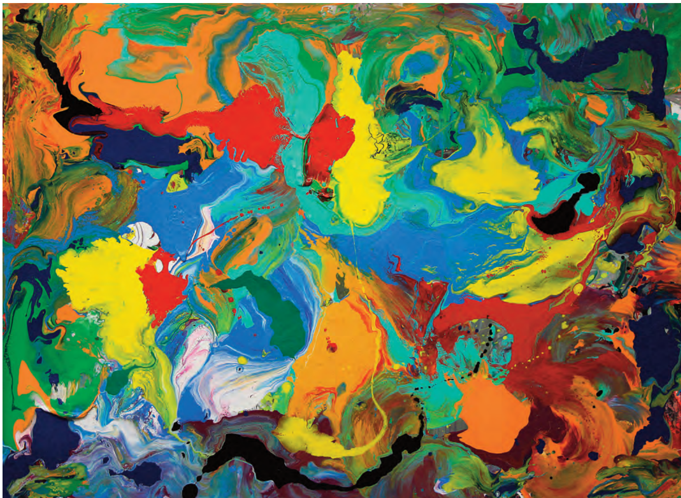
Cluffalo: Autumn 2015 Fourth State, 2015, latex on expanded pvc, 32 x 44 inches