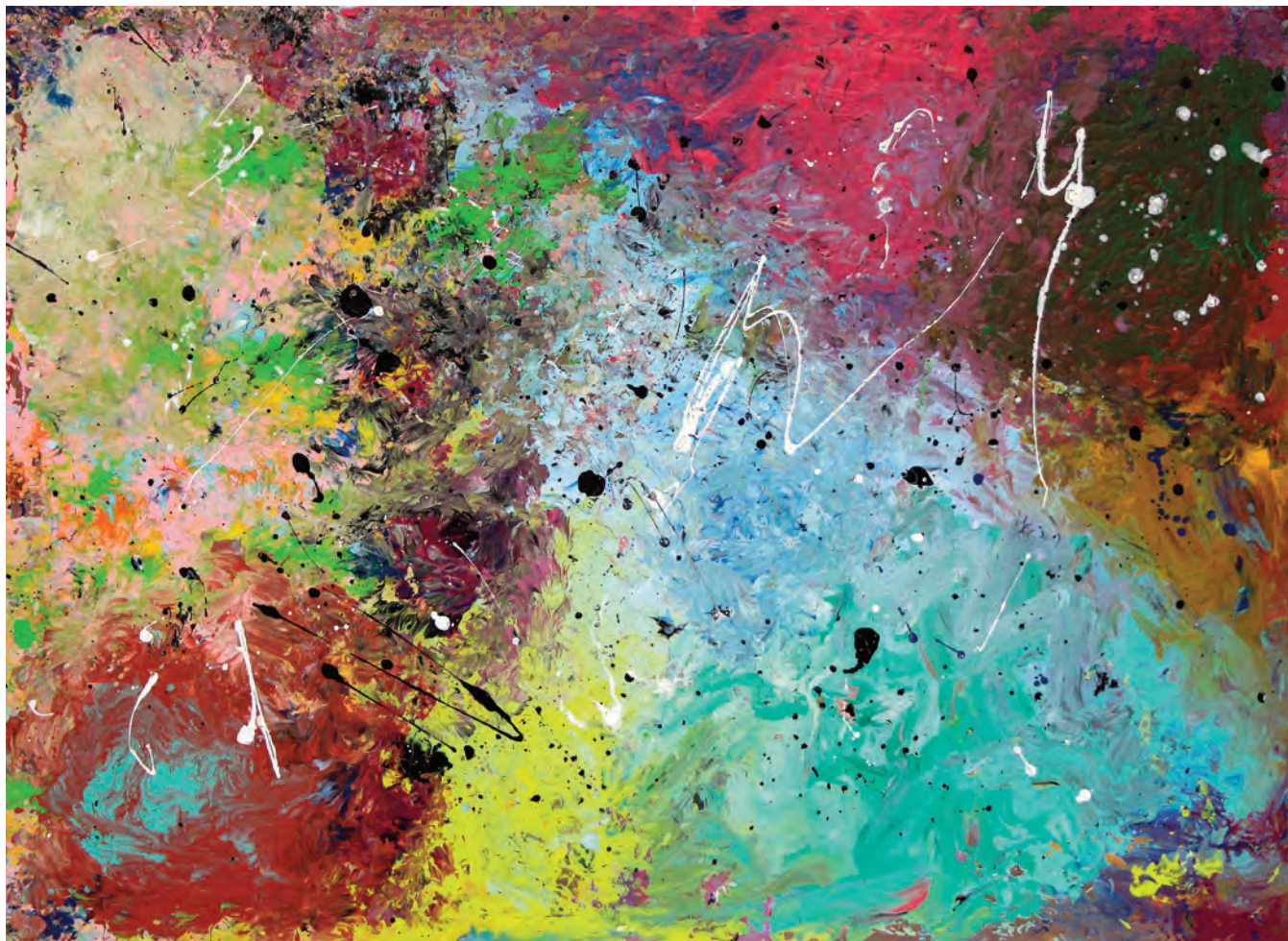
Cluffalo: Autumn 2015 Nineteenth State, 2015, latex on expanded pvc, 32 x 44 inches