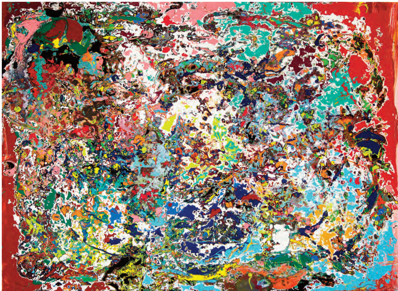
Cluffalo: Autumn 2015 Thirty-third State, 2015, latex on expanded pvc, 32 x 44 inches