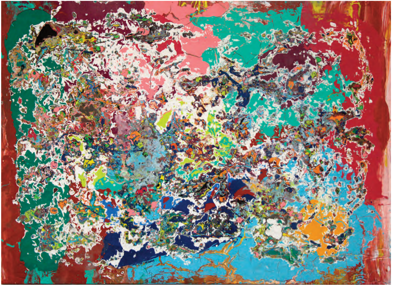
Cluffalo: Autumn 2015 Thirty-second State, 2015, latex on expanded pvc, 32 x 44 inches