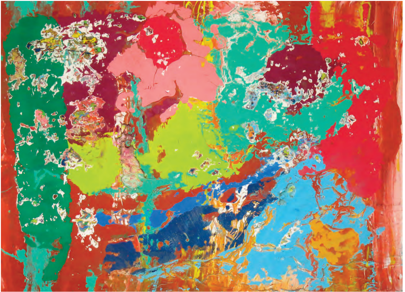
Cluffalo: Autumn 2015 Twenty-ninth State, 2015, latex on expanded pvc, 32 x 44 inches