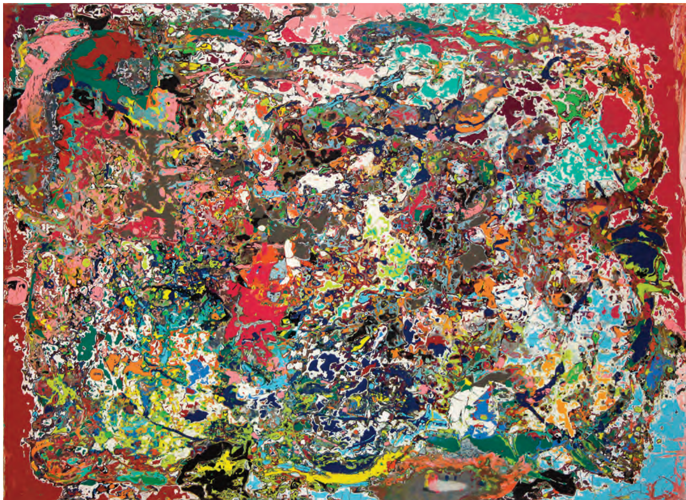
Cluffalo: Autumn 2015 , 2015, latex on expanded pvc, 32 x 44 inches