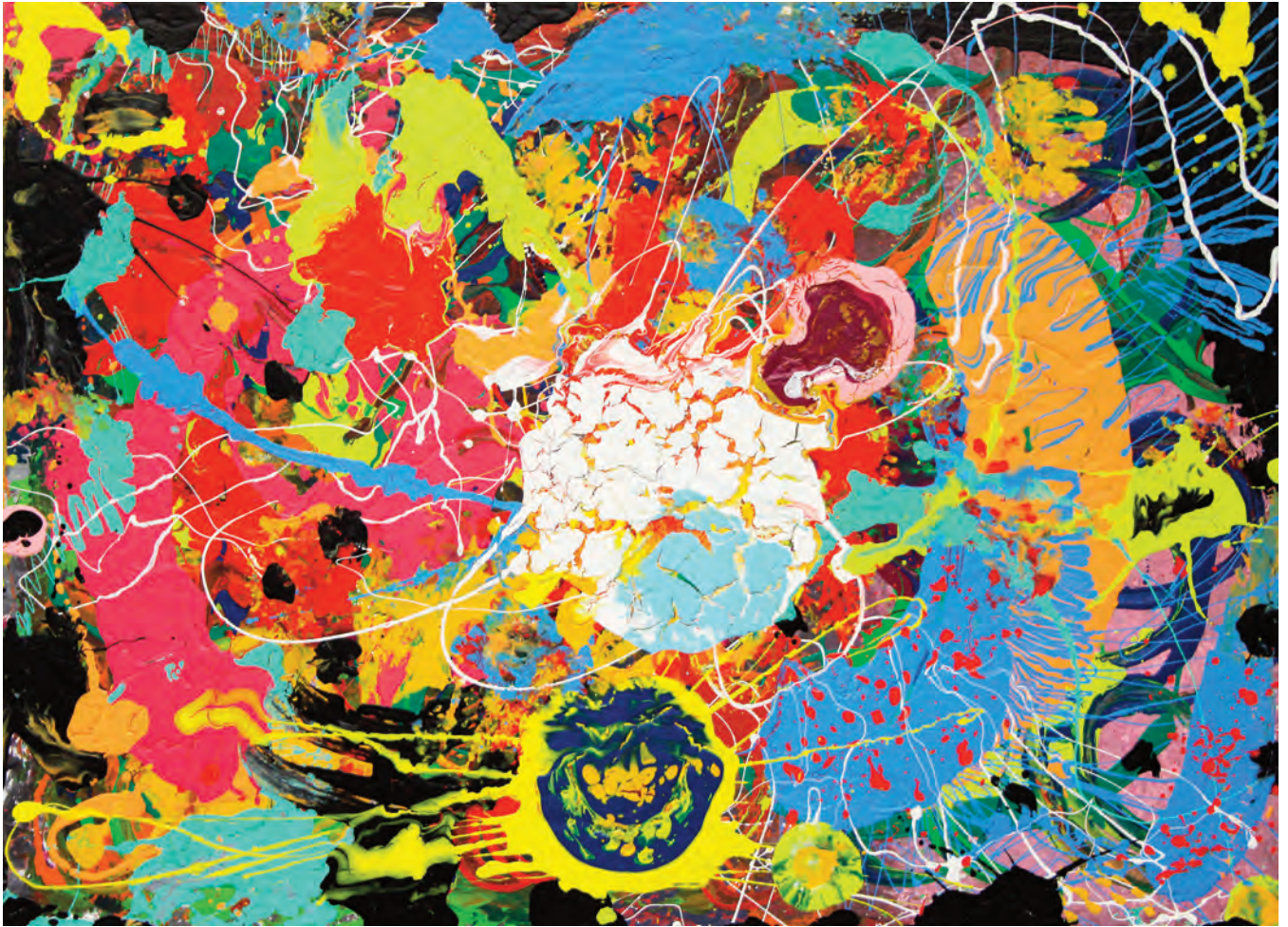
Cluffalo: Autumn 2015 Thirteenth State, 2015, latex on expanded pvc, 32 x 44 inches