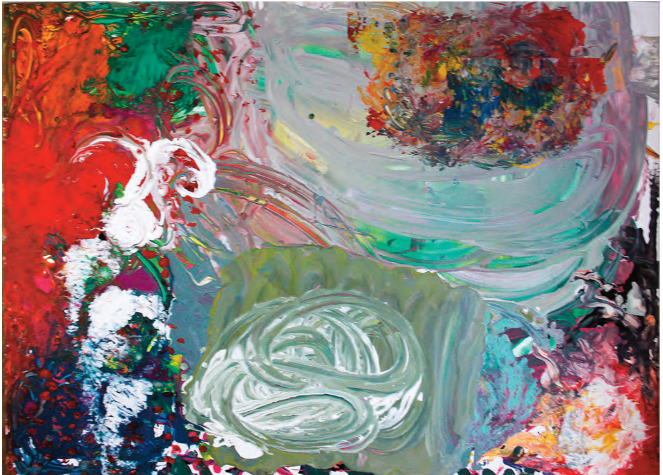
Cluffalo: Autumn 2015 Second State, 2015, latex on expanded pvc, 32 x 44 inches