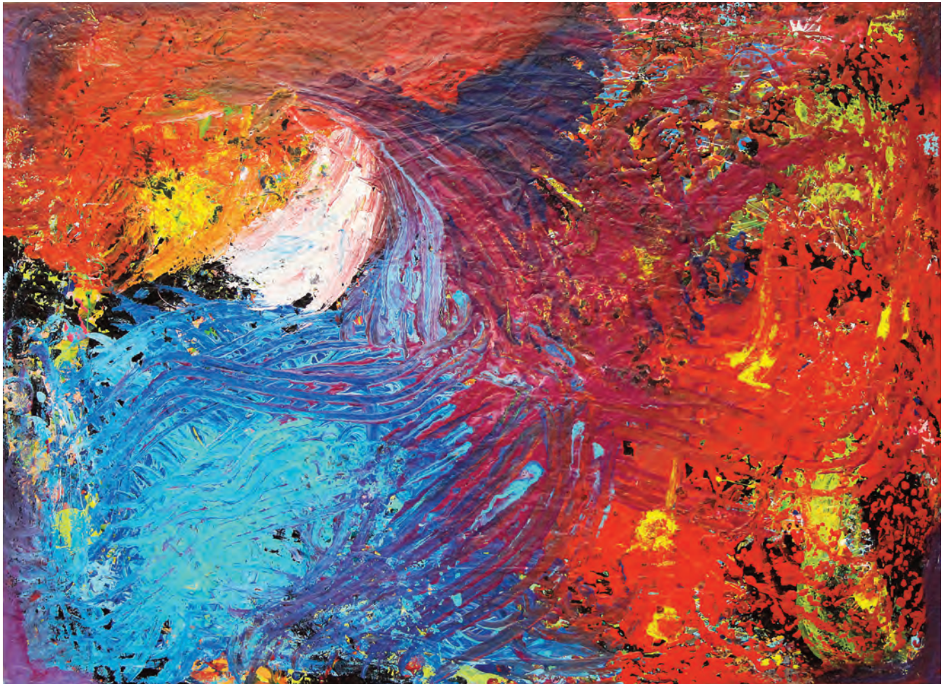
Cluffalo: Autumn 2015 Twenty-third State, 2015, latex on expanded pvc, 32 x 44 inches