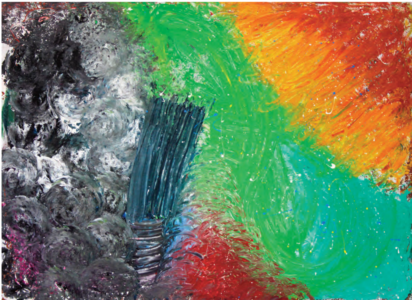
Cluffalo: Autumn 2015 Tenth State, 2015, latex on expanded pvc, 32 x 44 inches