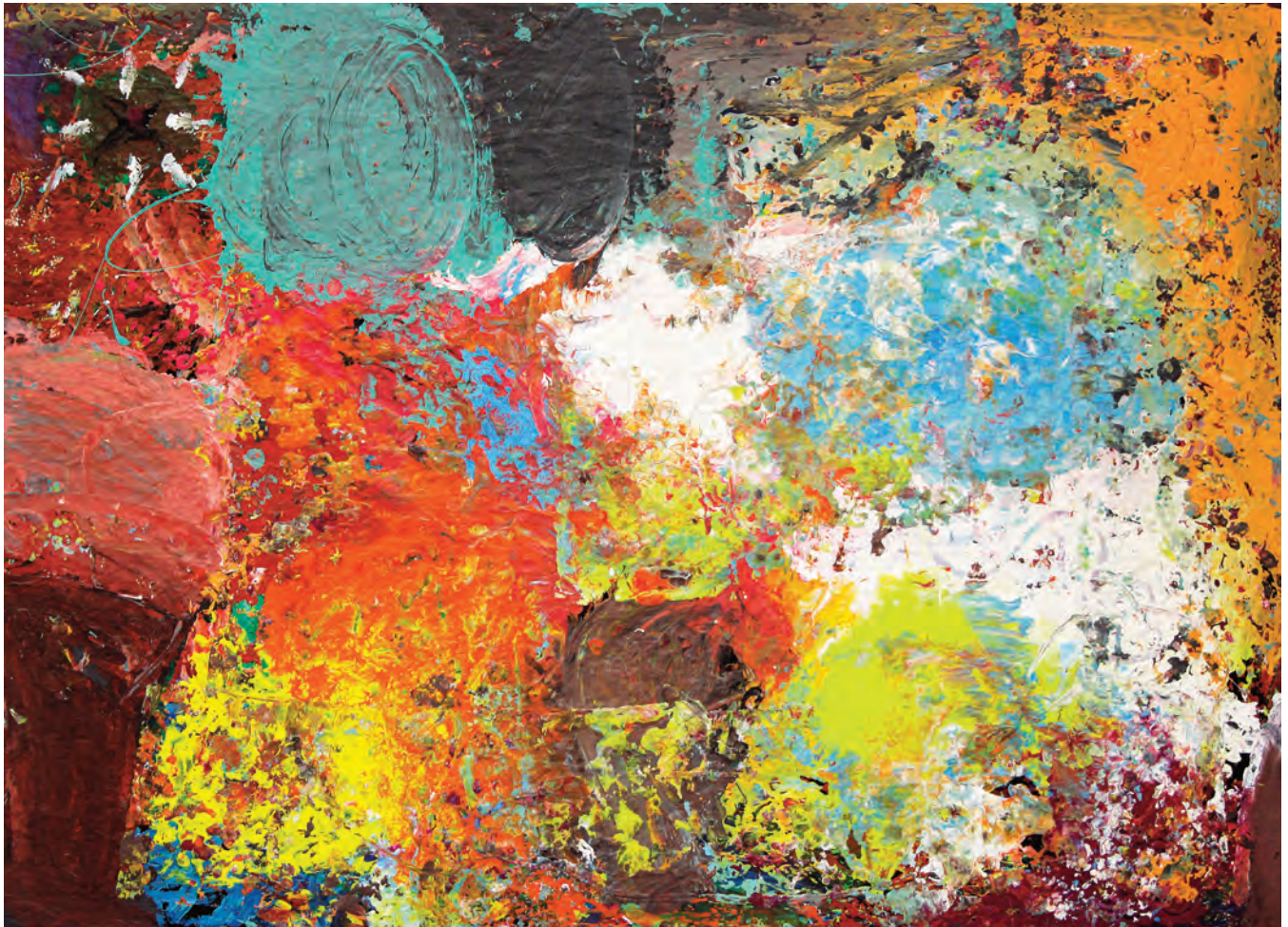
Clufffalo: Autumn 2015 Twenty-fifth State, 2015, latex on expanded pvc, 32 x 44 inches