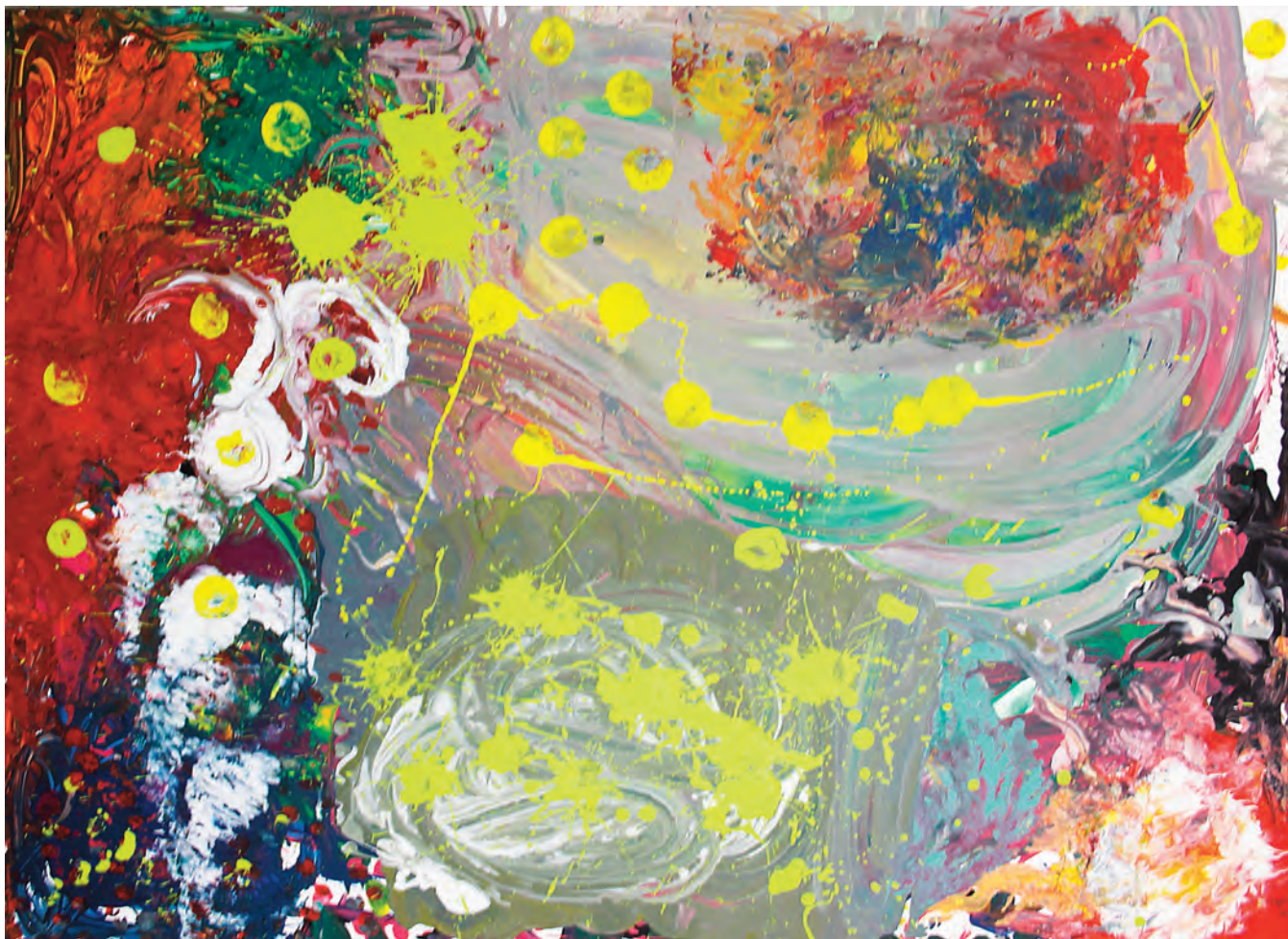
Cluffalo: Autumn 2015 Third State, 2015, latex on expanded pvc, 32 x 44 inches